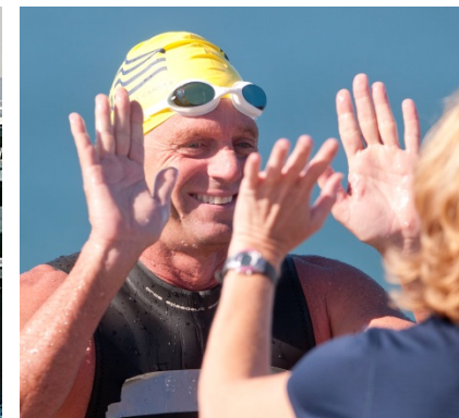
Rowdy Gaines: 3 gold Olympic medals Right Photo: Gaines at the finish line of the SAA – Rhode Island Swim