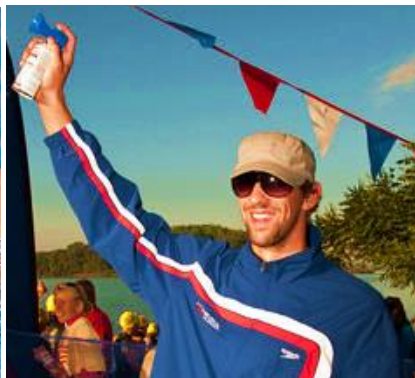
Michael Phelps: 18 gold, 2 silver and 2 bronze Olympic medals Right Photo: Phelps as the Official Race Starter for the SAA – Baltimore Swim