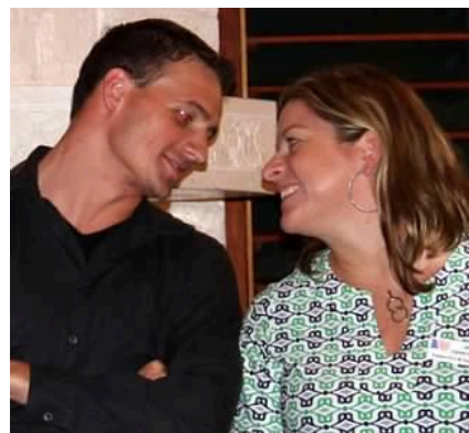
Ryan Lochte: 5 gold, 3 silver and 3 bronze Olympic medals Right Photo: Lochte pictured with SAA CEO Janel McCardle at SAA fundraiser.