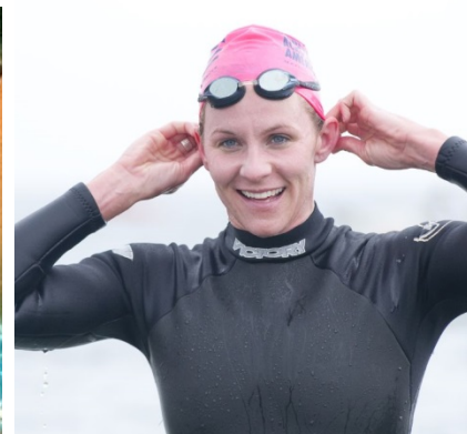
Jenny Thompson: 8 gold, 3 silver and 1 bronze Olympic medals Right Photo: Thompson at the finish line of the SAA – Nantasket Swim