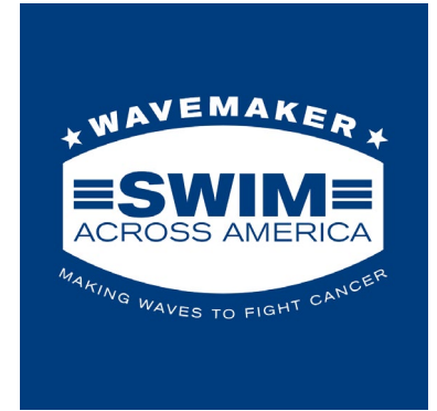
Wavemaker badge on blue background

Please see the reference below for how to properly size your Swim Across America logo and minimum sizing requirements.