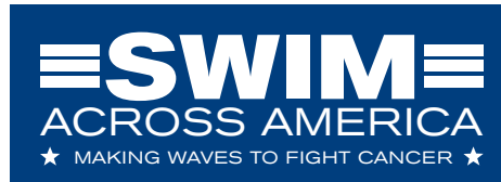
white on blue background