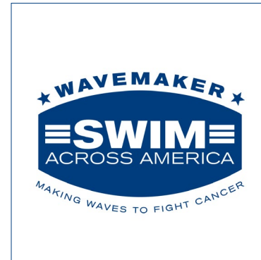
Wavemaker badge on white background