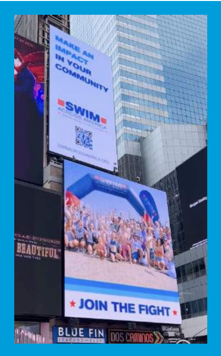
TIMES SQUARE PSA

THANKS TO OUR PARTNERSHIP WITH CLEAR CHANNEL